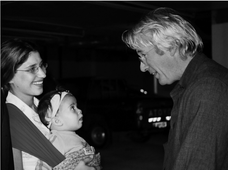
Richard Gere’s recent visit to the Middle East brought excitement, joy and hope to people of diverse histories, offering the prospect of healing and peace.