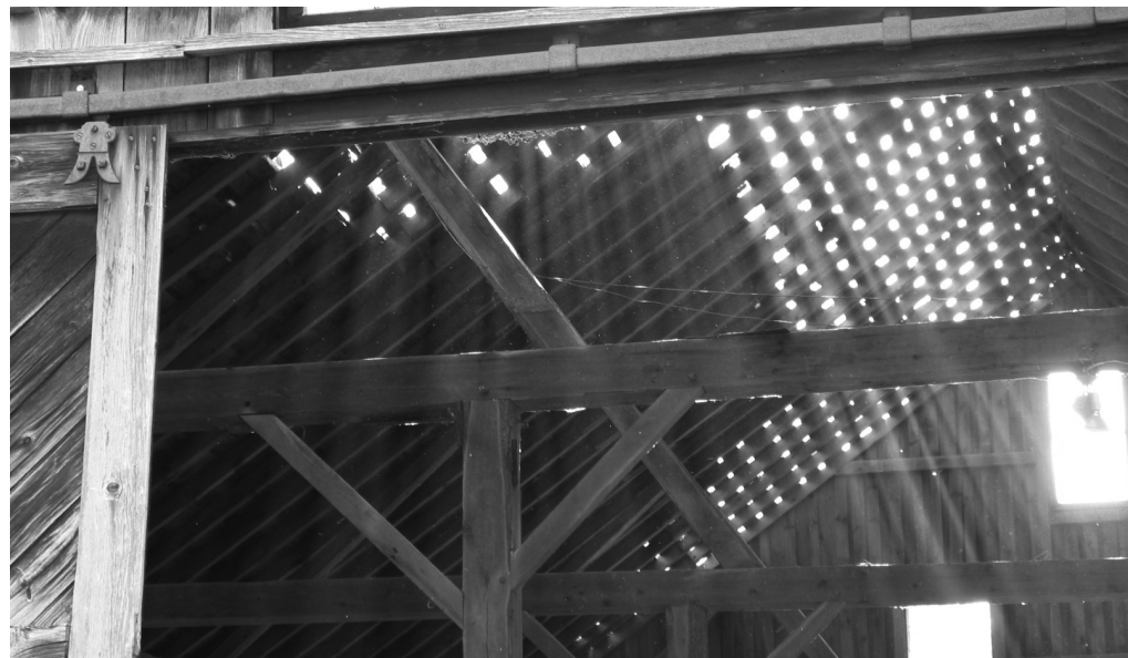
Sunlight filters through the exposed beams of the House of One People at the PCI Global Hub in Montague, Massachusetts.

peak. This hall is the embodiment of peace, and a space where spiritual practice and social action are honored and integrated. Other features of the House of One People under development include conference spaces, an upper mezzanine, sunny meeting rooms, passageways and sacred spaces. Construction on the House of One People began as the last vestiges of a long, hard, snowy winter melted away in April. Heavy and incessant rain notwithstanding, the new foundation was poured, the barn gutted, the preliminary architectural modifications completed. The centerpiece of the 34-acre Montague campus and the global hub for Peacemaker Circle, the House of One People is rapidly assuming its new form as a contemporary center for Peacemaker offices, sacred gatherings, multi-faith activities and circle development. This is the primary space where Peacemaker Circle will provide programming for campus events; hold conferences and workshops; facilitate all aspects of developing and linking Peacemaker Circles. Major developments of the greater campus are also underway. There is a new road cut through the property and the new artesian well has been drilled. Developments are underway for the sustainable agriculture program, a collaborative effort between Peacemaker Circle International, the Five-College System of the Pioneer Valley, and the greater local community.