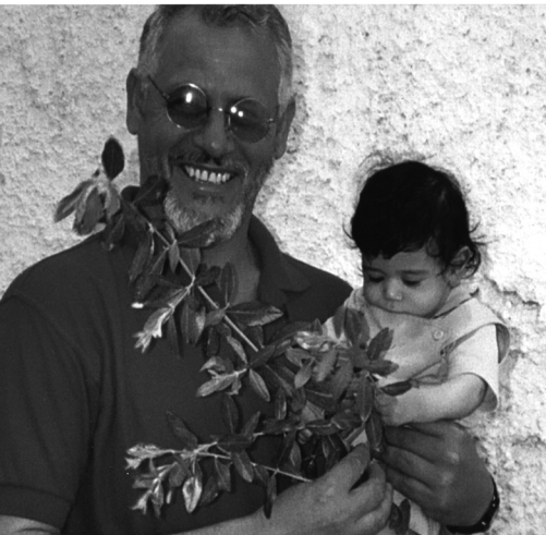
An Israeli Arab from Furadis cradles his two hopes for the future: his daughter, and an olive branch.