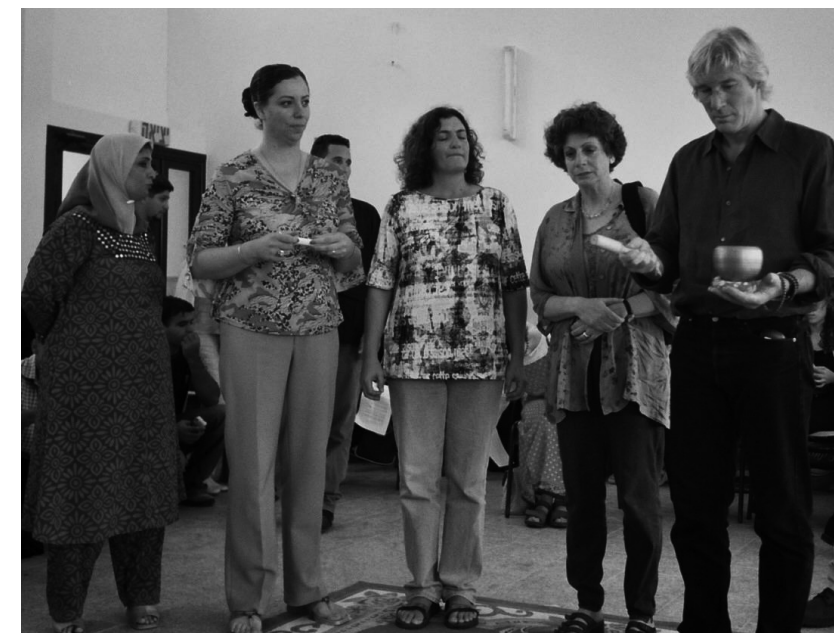
Special guest Richard Gere lends his support to a new Arab women's Peacemaker Circle in Furadis.

When Richard Gere arrived in the Arab Israeli village of Furadis, some 120 women were there to greet him. Standing in the middle of a circle of these women, comprising activists from many women's organizations and some women from the PC-Northern Israel circle, who had gathered for the daylong retreat, Mr. Gere sounded a Buddhist chime that brought complete silence to the group.