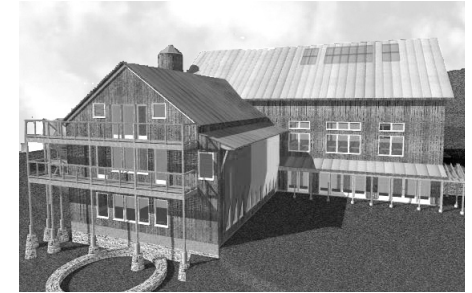
The House of One People will host workshops and trainings, and contain the offices of Peacemaker Circle International.

Peacemaker Circle International serves as a global hub, providing the administrative support, communication network and training in circle structures that are essential to the success of Peacemaker Circles. Located in Massachusetts, USA, on a 34-acre campus, Peacemaker Circle International connects members and circles around the world. The campus also contains a Peacemaker Institute , which provides training for activists in circle development, cross-cultural communication, and group process. Activists from various countries come here to train in the circle methodology and return to their respective homes to organize and link circles. In addition to giving classes, workshops, and conferences on a variety of peacemaking tools, it assists members in locating off-campus peacemaker trainings wherever they're given.