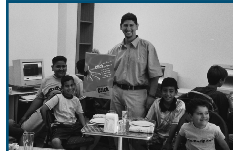
The new Internet Café in Faradis.

The result? An integrated and holistic movement of spiritually based activists initiating and affecting change around the world through collaborative action on all levels. Peacemaker Circles are creating a new paradigm for working with deep-seated economic, social and environmental issues through the integration of different approaches and methods.